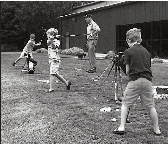
Summer Camp Fun with PC