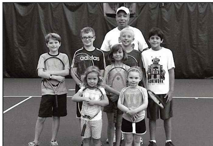
July Summer Camp